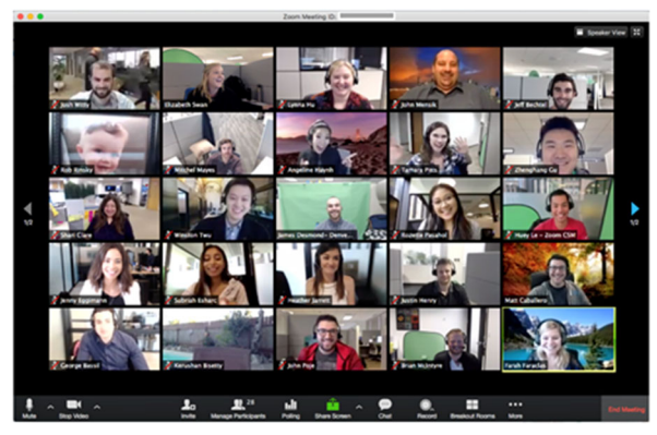
Screenshot of an Online Coin Club meeting via Zoom.

https://www.facebook.com/The-Online-Coin-Club-103366421331294/